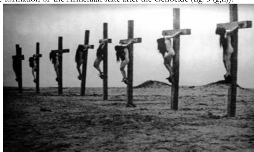
Fig. 3 (e) A line of naked, crucified Armenian girls

symbolism, the passions of Jesus Christ, the idea of martyrdom and, finally, resurrection that follows crucifixion. The aforementioned images frame discourses on that historical period. At the same time, the Christian symbolism of resurrection after crucifixion represents the rebirth of the Armenian nation and the formation of the Armenian state after the Genocide (fig. 3 (g,h)).