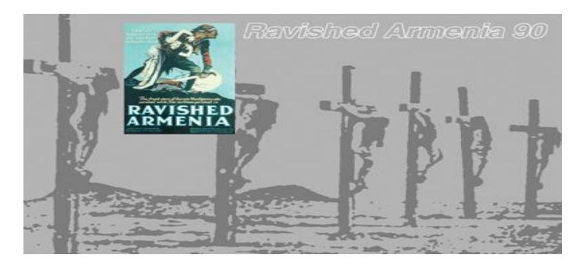
Fig. 3 (g) Postcard issued on the occasion of the 90th anniversary of the screening of Ravished Armenia