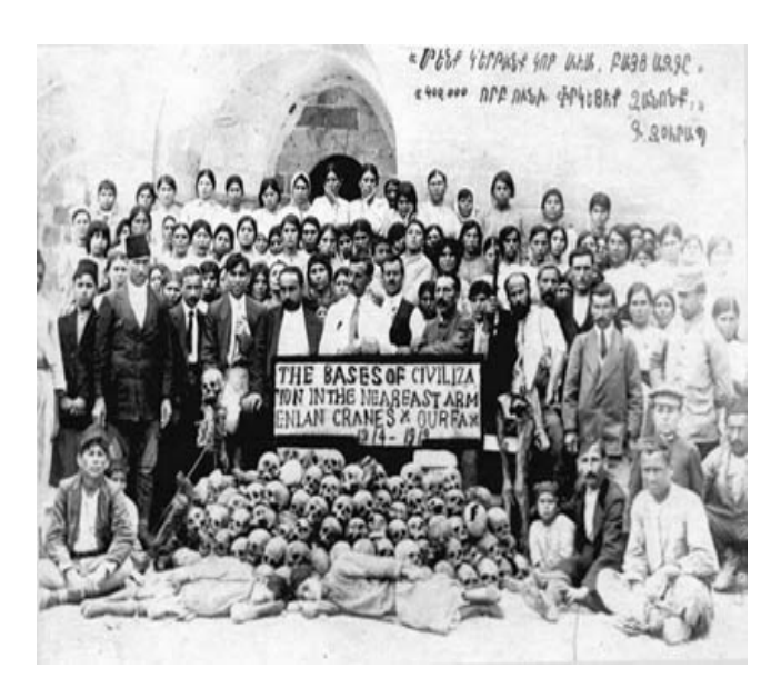
Fig 4 (k) Armenian refugees at the pyramid made from the sculls of Armenian martyrs