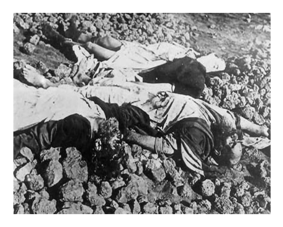
Fig. 4 (h) Tortured and killed Armenian clergymen

Finally, the discourses on the "survival", "rebirth" and "revival" find their symbolic representations in the photographs of the Genocide survivors and refugees. Death and human loss are always persistent in these photos, creating binary representations of the survivors and the victims (fig. 4(k)) as an ahistorical memory of the Armenian loss.