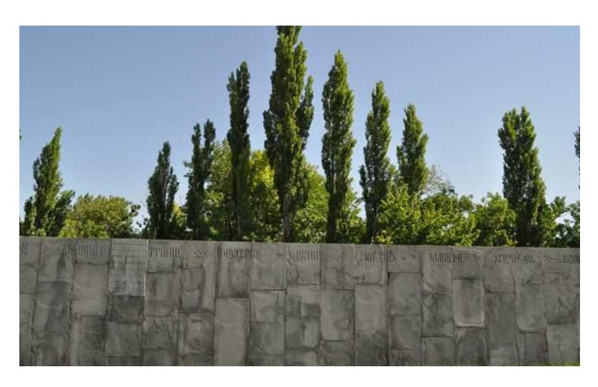
Fig. 3 (d) The Armenian Genocide Memorial Wall in Tstitsernakaberd, Yerevan

Let's analyze, for example, one of the exhibits of AGMI's Permanent Exhibition - the illustrations and photos of Arshaluys (Aurora) Mardiganian's documentary memoir "Ravished Armenia"<sup>20</sup>. The choice of the documentary itself frames a specific category which the state is using repetitively in producing discourses on the Genocide-torn Armenian nation. What is most important here is the poster of the documentary entitled "Auction of Souls" and the photo of crucified Armenian girls (fig. 3 (e,f)).