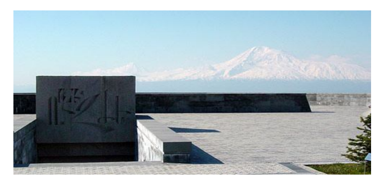
Fig. 3 (b) The entrance to the Armenian Genocide Museum-Institute in Yerevan