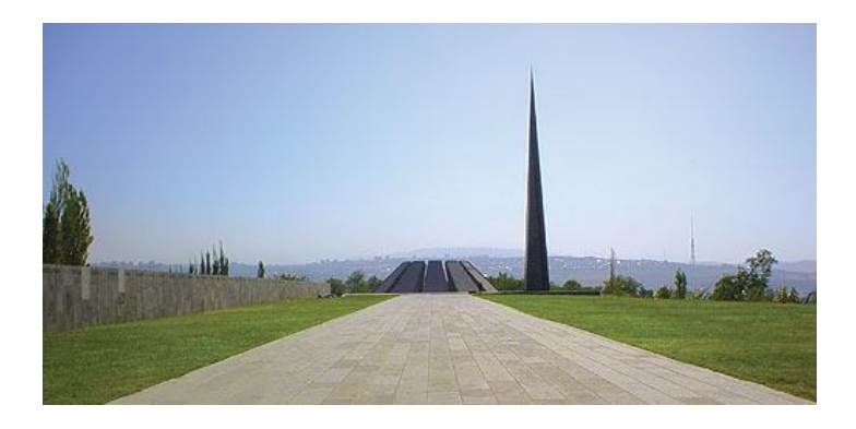
Fig. 3 (a) The Armenian Genocide Memorial-Complex in Yerevan

The discourse on the lost land is visually represented in all the monuments located in Tsitsernakaberd. In 1997, the Museum-Institute exhibited the first glass jar of soil from an Anatolian vilayet as a relic from the lost homeland. In a couple of years, the practice of "bringing soil back from Western Armenia" became an inseparable part of the remembrance (fig. 3 (c)). Ten years later, Armenia's land claims got their political interpretation in the discussed Armenian-Turkish protocols<sup>19</sup>.