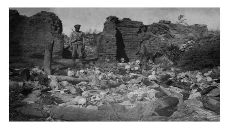
Fig. 4 (e) Armenians burnt alive in Sheykhalan by Turkish Soldiers, 1915

Finally, the last category that I analyze in Chapter 4.2 is the representations of dead bodies in the AGMI permanent exhibition. The aim is to find a nexus between the 'situatedness' of the images of dead bodies and the specific knowledge they produce on the Armenian Genocide.