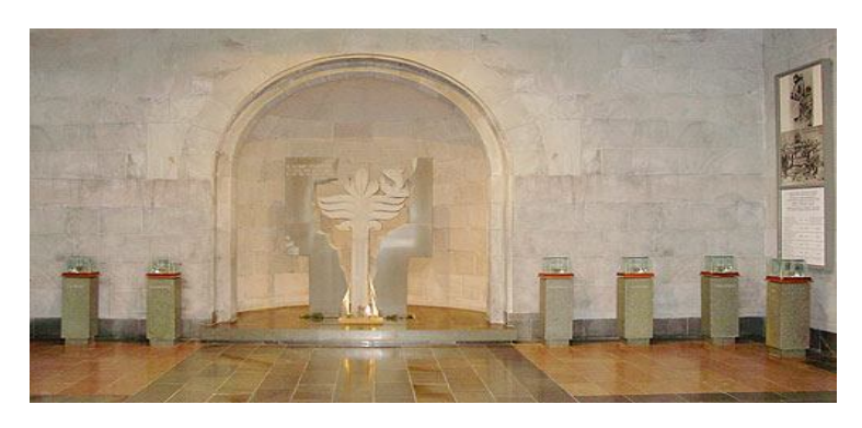
Fig. 3 (c) The third exhibit hall of the Armenian Genocide Museum with soil glasses from all the 12 Anatolian vilayets