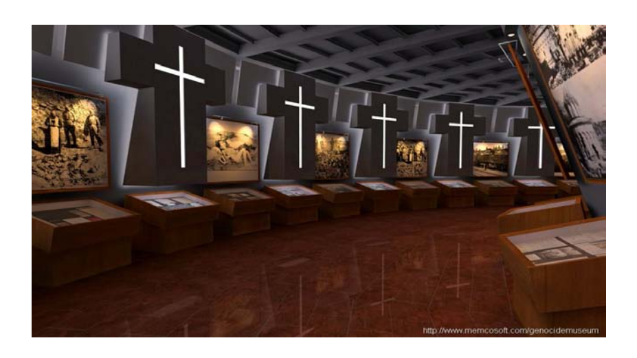
Fig. 4 (a) The Permanent Exhibition hall of AGMI

The marble and basalt-carved walls of the AGMI permanent exhibition halls generate a panorama of black-and-white photographs illustrating the death marches of Armenians in Ottoman Turkey. The exhibits take the visitors down to the memory lane, creating a sense of pandemoniac solemnity. The exhibit halls resemble an early Christian tomb, and the only source of light comes through the cross-shaped windows (fig. 4 (a)). The images are exhibited along with relics and textual materials collected from all the vilayets of Anatolia.