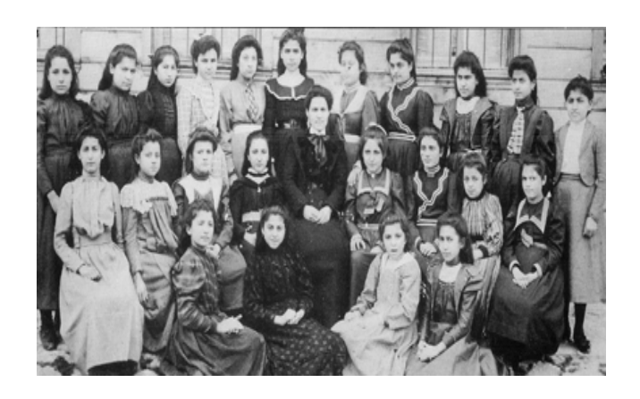
Fig. 4 (c) Female college, Adabazar, 1900