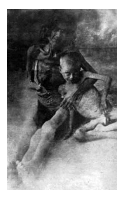
Fig. 4 (g Starved Armenian woman with her son in Syrian desert, 1916