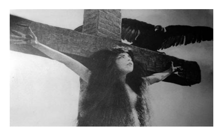
Fig. 4 (i) A typical exploitative shot