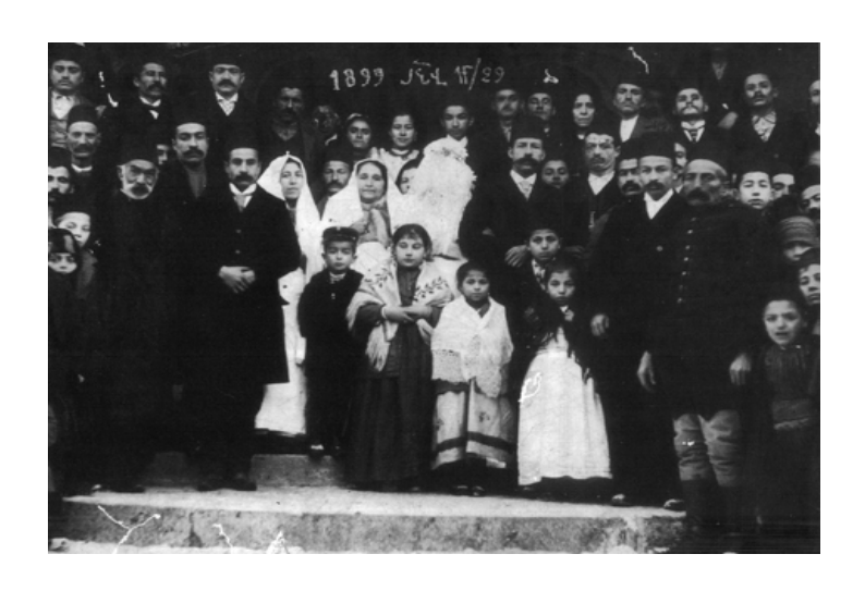
Fig. 4 (b) Armenian wedding in Tokat, Ottoman Empire, 1899